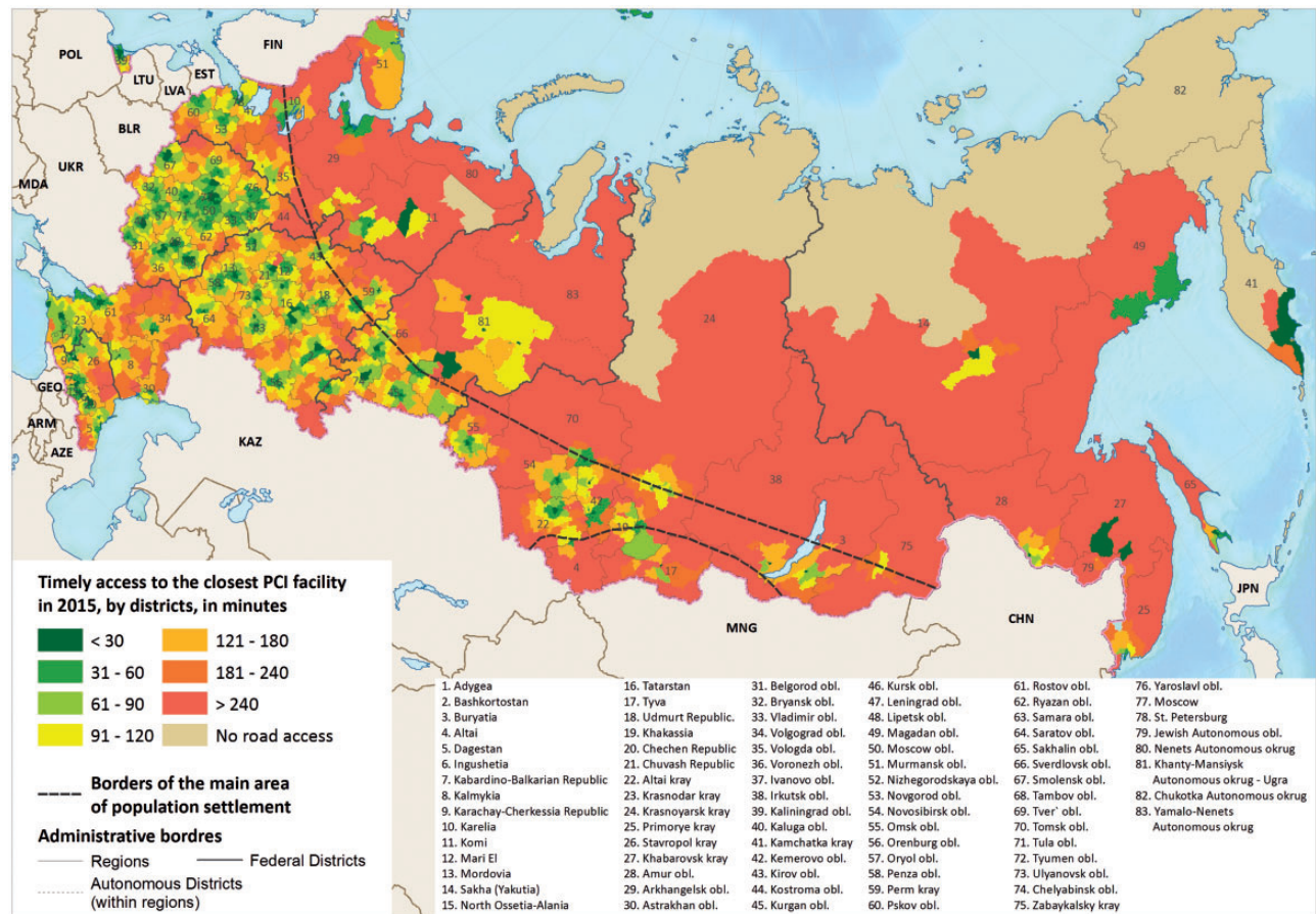
Figure 2. Driving times to the closest PCI facility in Russia in 2015.

The results shown so far have estimated travel times to the nearest PCI facility regardless of which region it was in. However, the financing and delivery of health care are largely devolved to the regions, so patients will normally be treated in the region in which they reside. For some people, the obligation to be treated in their home region might increase travel times compared with going to a facility that is closer but in another region. Consequently, we undertook a sensitivity analysis to compare differences in travel times to the nearest PCI facility in the same region or to the nearest facility wherever it is. This showed that, in 2015, 7 441 200 people or 11% of the population aged 40+ years lived in 400 bordering districts where it would be faster to go to neighbouring regions for treatment. For another 231 500 people who lived in 15 districts, PCI facilities are located only in neighbouring regions (Supplementary Figure 3, available as Supplementary data at IJE online). However, this option is associated with a relatively small increase of about 0.5% (337 690 people) in those who would live within 60 minutes' travel time and 2.3% (1 456 130 people) within 120 minutes' travel time.